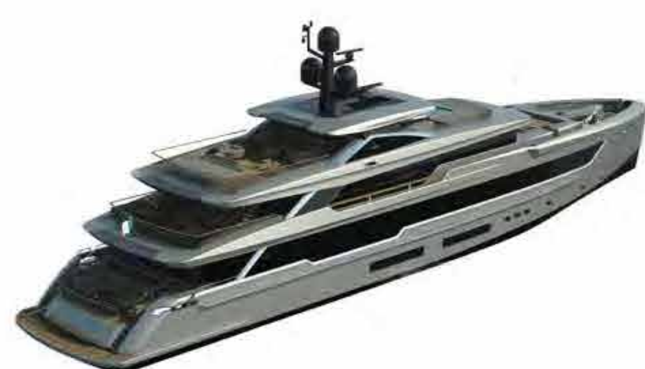
Project S532