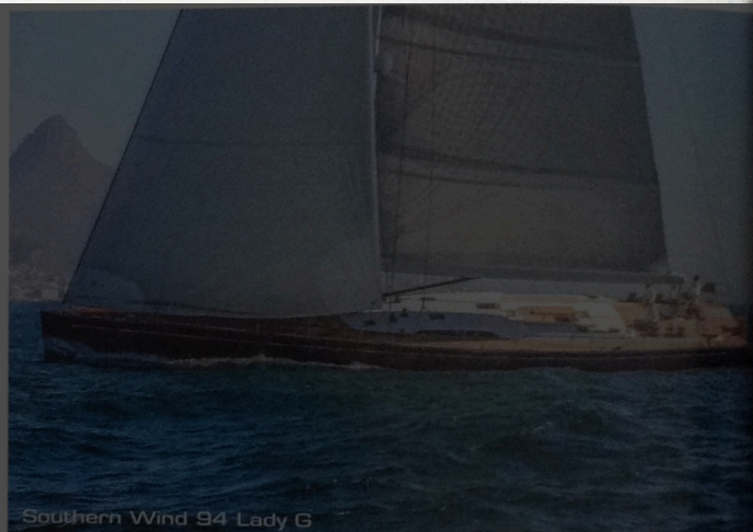
Southern Wind 94 Lady G