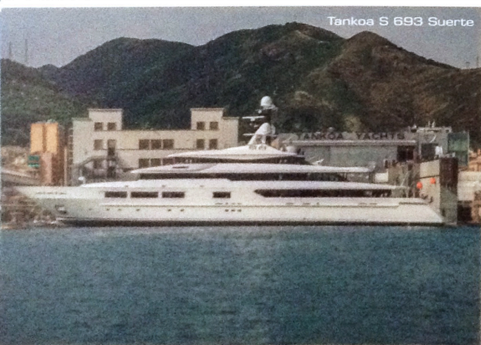
Tankoa S 693 Suerte