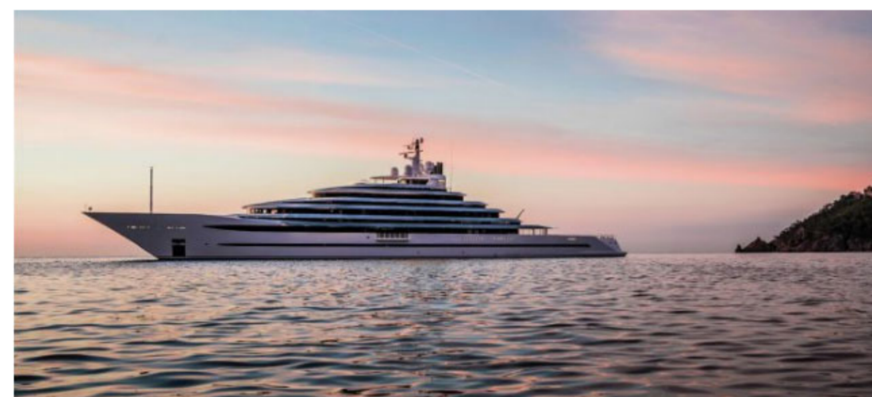
Jubilee by Oceanco

Burgess Yachts brought the new 110m Jubilee by Oceanco, the largest yacht from The Netherlands and the largest to ever grace Monaco Yacht Show. The vessel became an instant star by winning both the MYS Exterior Design Award and also winner of the MYS Finest Superyacht Award 2017.