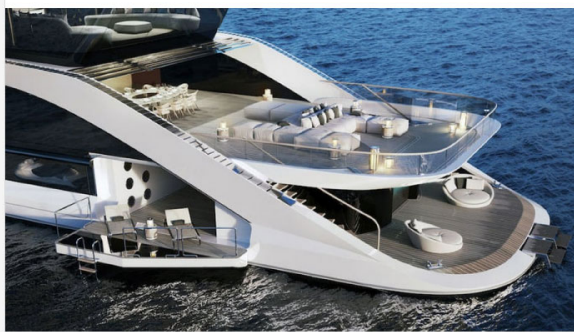
Progetto Bolide Concept - Tankoa Yachts & Exclusiva Design

It took two years of research, design and development to imagine Progetto Bolide , a vessel that aims to add new value to the world of luxury yachting. The 72-meter motor yacht will be powered by twin CAT engines, thus enabling it to achieve 18 knots and cruise at 12.5 knots.